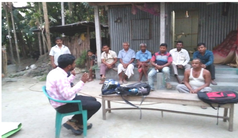
Field visit under FPO Project, North Bengal

CUTS will have to submit the DPR to the Small Farmers Agribusiness Consortium (SFAC) by the end of June 2021.