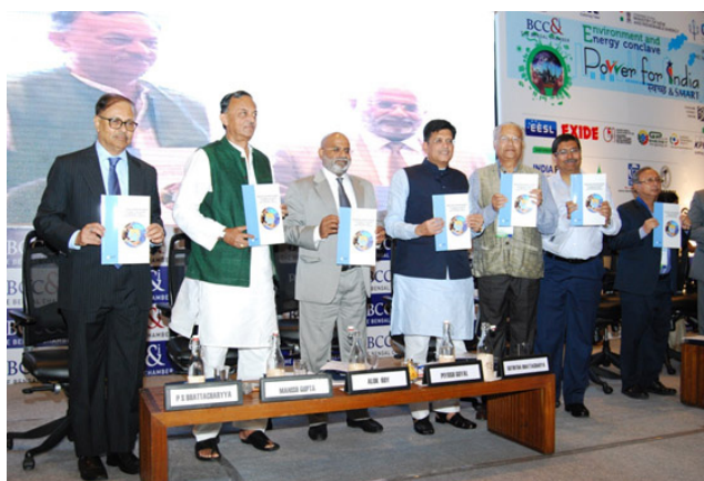
Release of CUTS' Report at BCC&I Energy Conclave