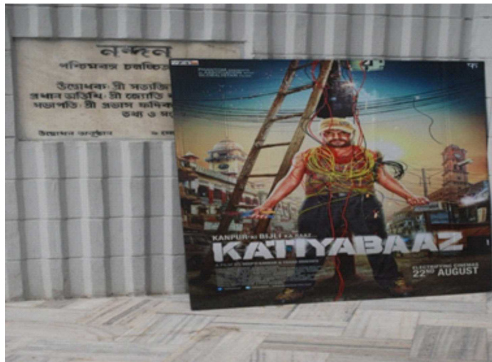
KATIYABAAZ Screening at NANDAN III

Film screening was a huge success with more than 100 participants from government departments, academia, utilities, media, common consumers, etc. The discussion session after the event was very interesting. This event generated a lot of interest and there are possibilities of its screenings with utilities. Many media articles were published on the same.