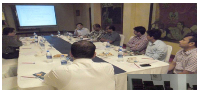
← Meeting at Mumbai