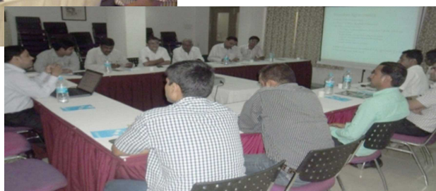
Meeting at Nashik →